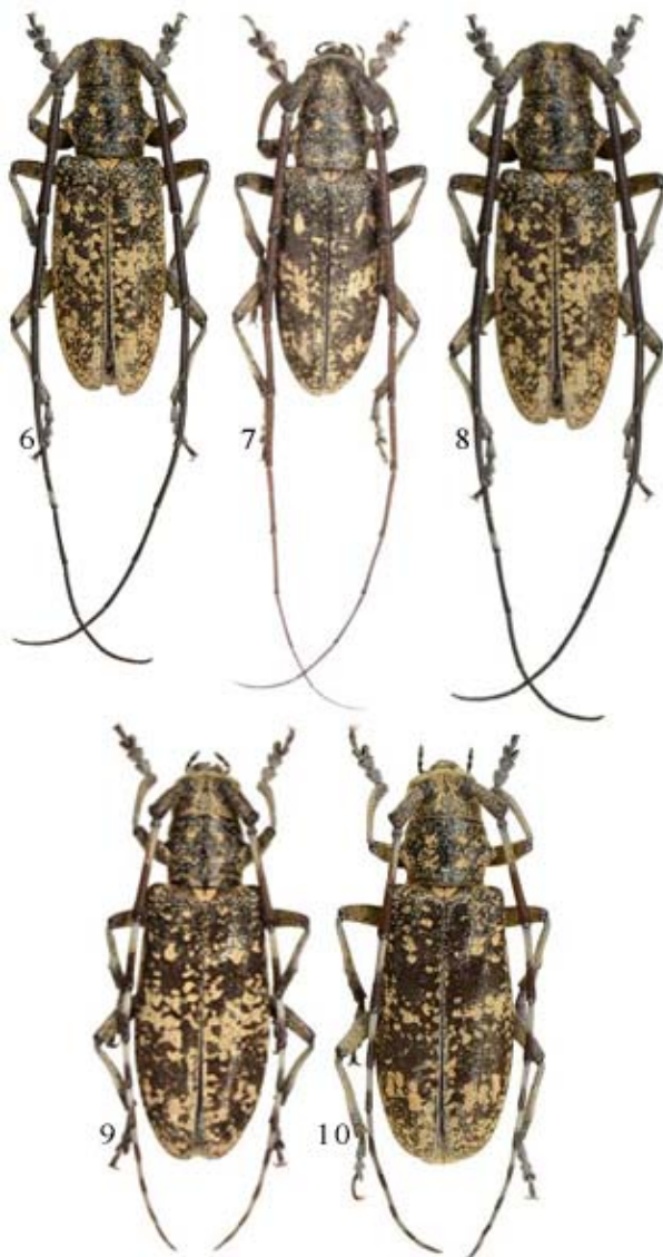
Figs 6-10. Monochamus saltuarius occidentalis ssp. n.:

6 - Holotype, male, Bohemia 1966, Chlum u Tř., M. Sláma lgt.; 7-8 - Paratypes, males, Bohemia, Chlum u Třeboně; 9-10 - Paratypes, females from same locality.