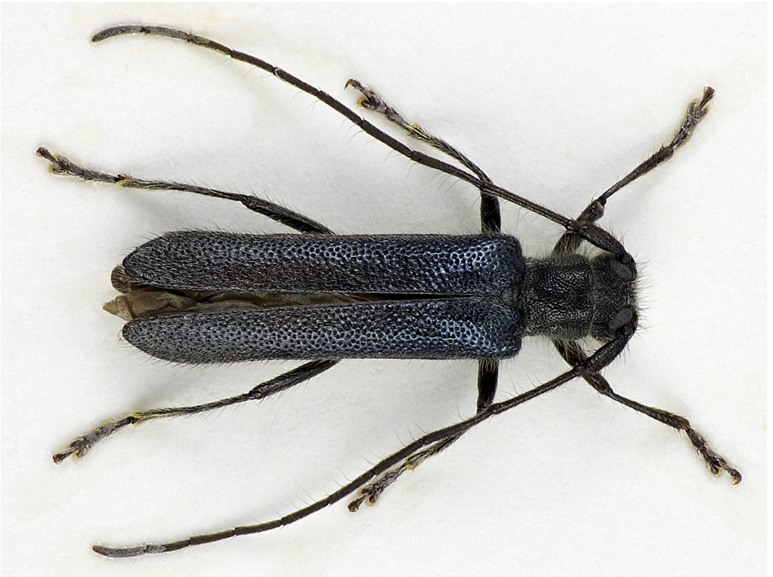
FIGURE 2. Stenostola dubia (Laicharting, 1784) from mass occurrence at Borre, Eikenes, west of Borrevann (EIS 19) 1979.06.20.