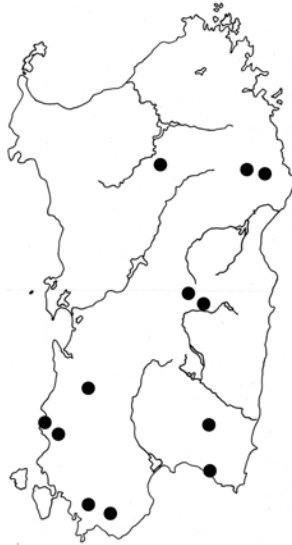
Fig. 9 – Distribution of Trichoferus arenbergeri (Sardinia).

During the first year, the young larva bores a descending gallery inside the tap root of the host plant, usually feeding out to near the tip, and fills it with powdery, compressed frass. This first period of larval activity does not cause the death of the plant. After hibernation, the larva starts to bore a new, ascending, broad feeding gallery filled with coarser frass intermixed with fibrous shreds and excrement, causing the death of the plant. Occasionally two or three larvae occur in the same plant: in these cases, short burrows bored in the lower region of stems have been observed as well. Once mature, usually in May, the larva enlarges the upper portion of the feeding gallery, making a large, elongated cell, where it pupates. According to the authors' observations, pupation requires 11-13 days.