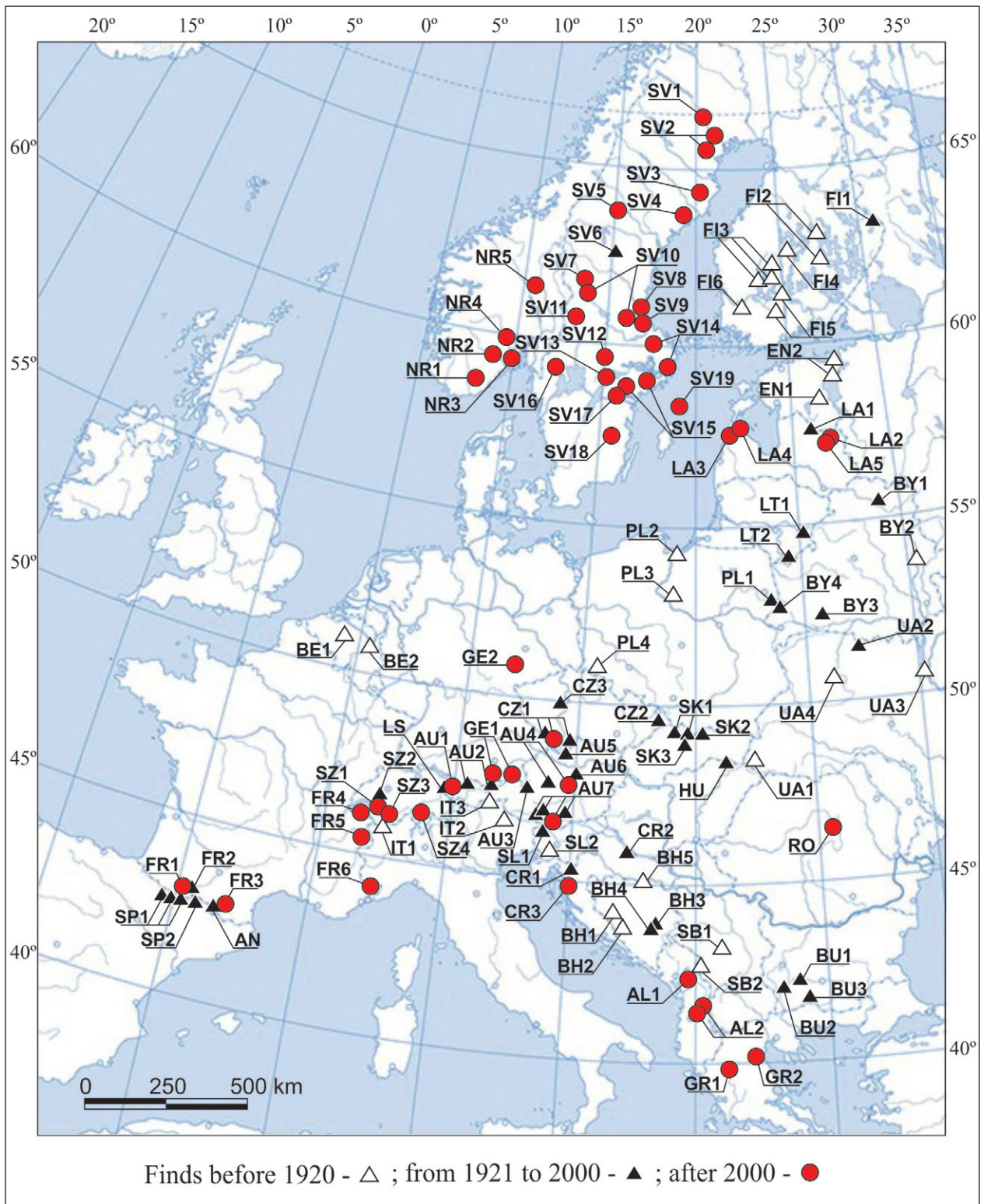
Figure 2. Distribution records of Tragosoma deparium (Linnaeus, 1767) in Europe.

specimen in the Zemplén Mountains in north-eastern Hungary in 1986 (Medvegy 2001). Slovenia (SL) : one specimen in the Julian Alps in northern Gorizia Region (1) in 1952; additional 19 th century records in Carniola (2) (Breljih et al. 2006). Croatia (CR) : Velika Kapela (1) and Velebit mountain ranges in the western Croatia; Virovitica-Podravina County (2) (Mikšić and Georgijević 1971); Nikola Rahme (pers. comm.) reported that he found larvae and adults in the Northern Velebit National